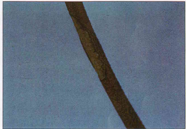
Figure 3 - Case Beetle Bark Damage

insecticide treatment to control this insect. The larval stage is the most easily controlled stage.