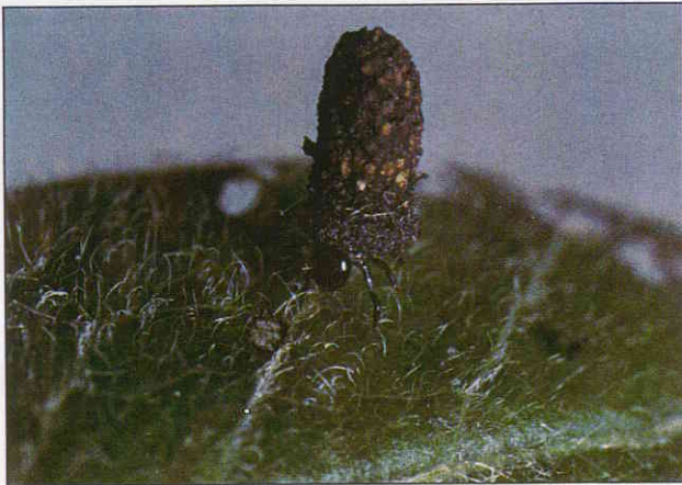
Figure 2 – Case Beetle Larva

The pupa is enclosed in the last larval case, and is attached to leaves or stems.